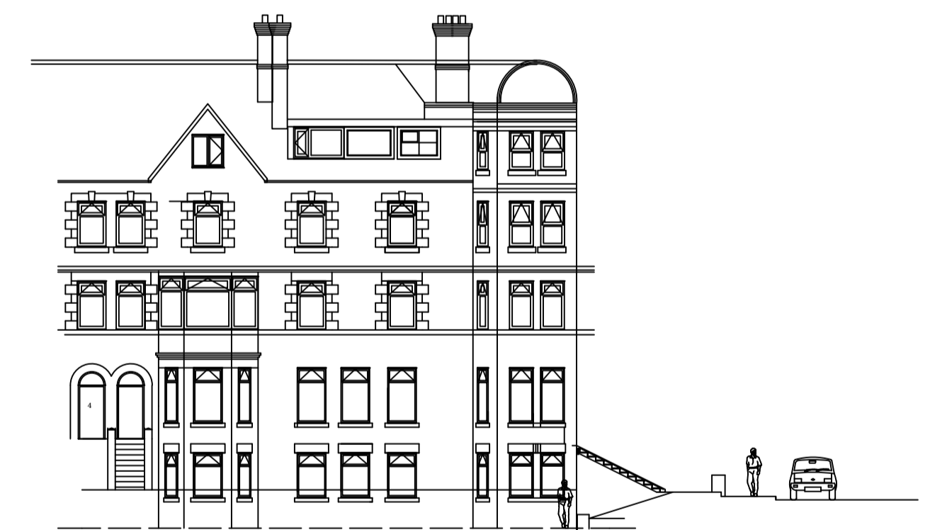
FRONT SOUTH ELEVATION

APPLIED SURVEYING & DESIGN (YORK) LTD VINE HOUSE 21 MAIN STREET STAMFORD BRIDGE TELEPHONE 01759 372779