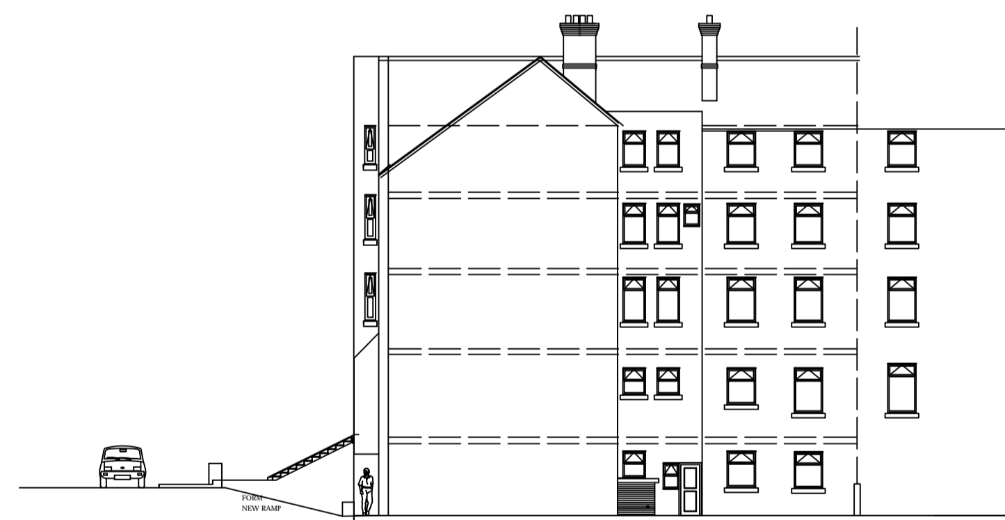
REAR NORTH ELEVATION