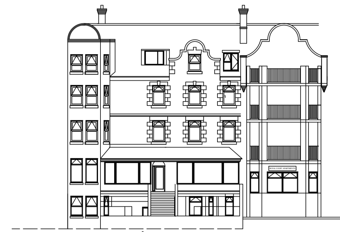
FRONT EAST ELEVATION