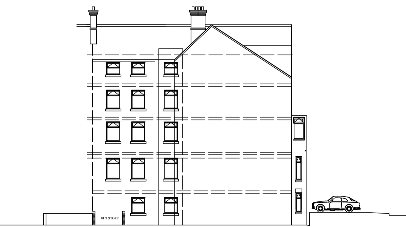
REAR WEST ELEVATION