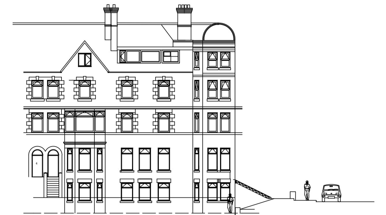
FRONT SOUTH ELEVATION